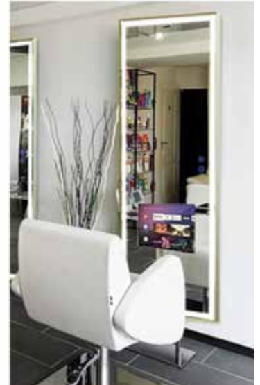
Hairdressing Salon Mirror TV