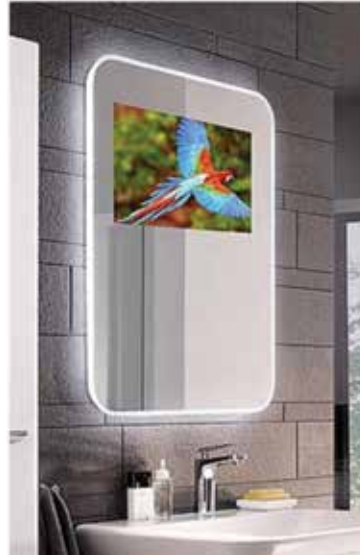
Bathroom Vanity Mirror TV